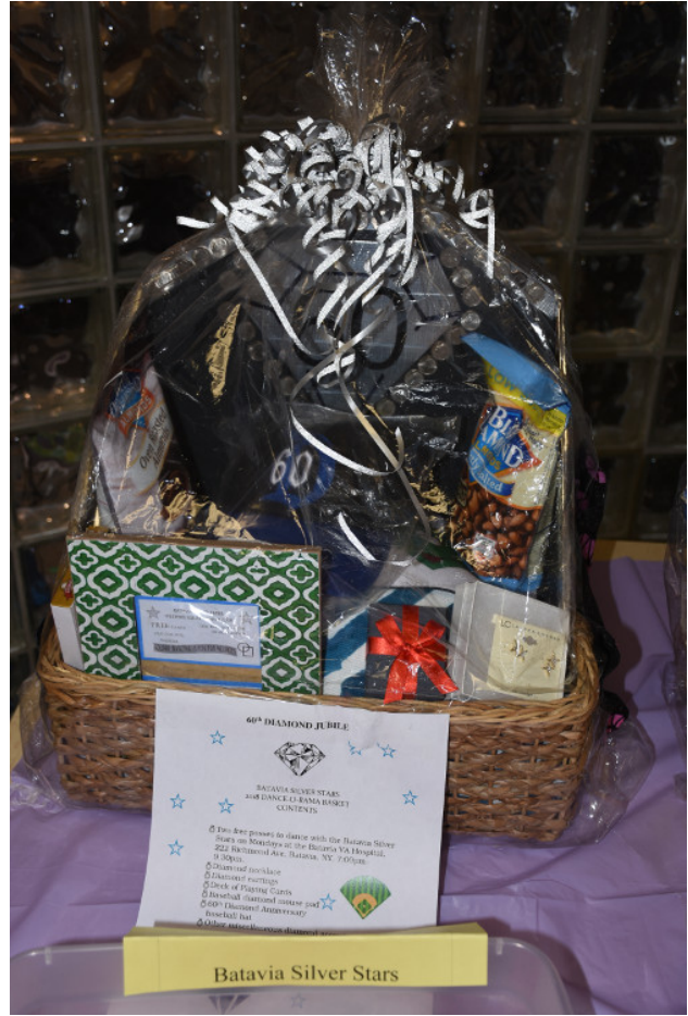
Batavia Silver Stars