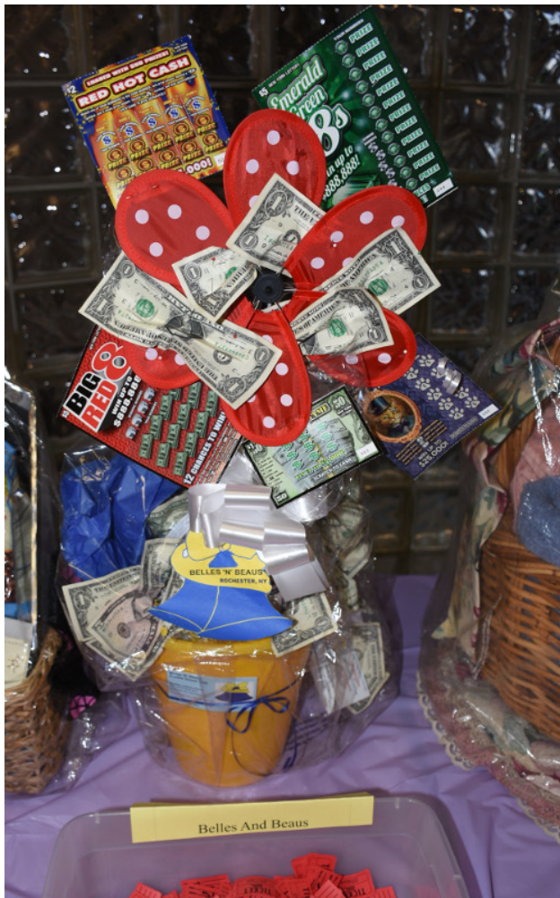
Belles And Beaus